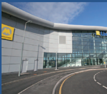
Liverpool South Parkway station with airport link