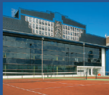
David Lloyd Leisure