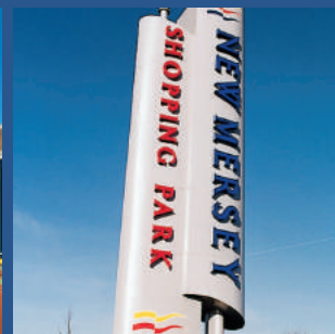
New Mersey Shopping Park